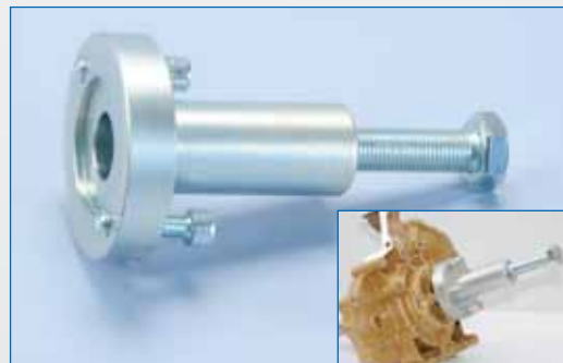
928.695.001 - THOR 100, 130, 190 ELECT. STARTER, 200, 250