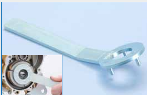
144.695.006 - THOR 100, 130