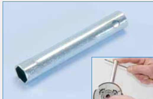
144.695.005 - THOR 100, 130