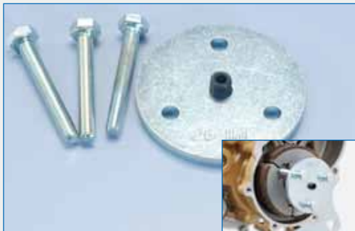
144.695.004 - THOR 100, 130