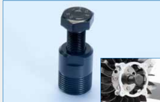
143.695.001 - THOR 100 (dal motore n.0676 - from engine n.0676 du moteur nr.0676) THOR 130, 190 ELECT. STARTER, 200, 250